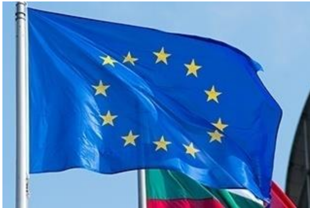
Figure 10.4 The European flag.