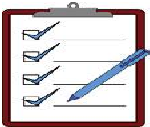
Figure 10.9 Goal listing clip board