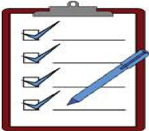
Figure 10.3 Sample of listed goals ticking clip board picture by the European Union

Source: (European Union, 2021, https://europa.eu/ ).