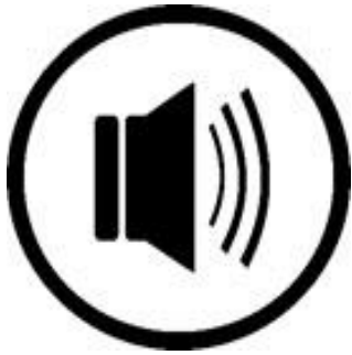
Figure 10.5: Anthem listening link